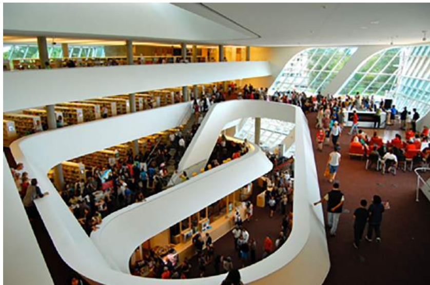
The City Centre Branch of Surrey Libraries.