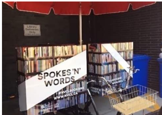
The North Vancouver City Library Book Bike