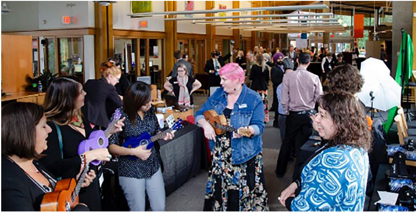
UBCM 2018 and Future Focused Public Libraries.

Over 70 elected officials and government staff attended the BC Public Library Partners' September 12th Union of BC Municipalities Convention event, Future Focused: Public Libraries and British Columbia .